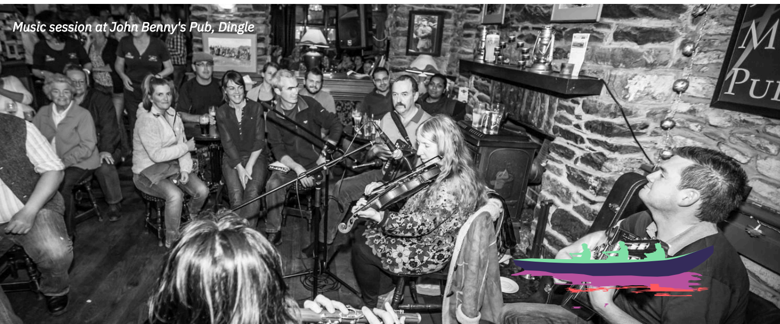
Music session at John Benny's Pub, Dingle